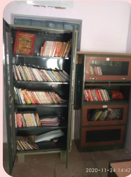
3K books donated