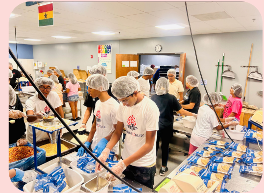
20+ Chicagoland community service events