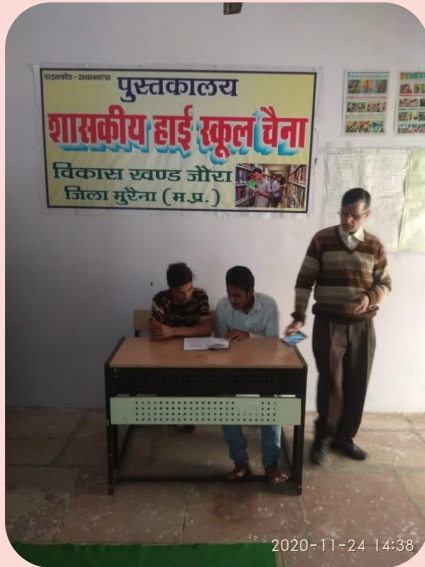
2 libraries in India